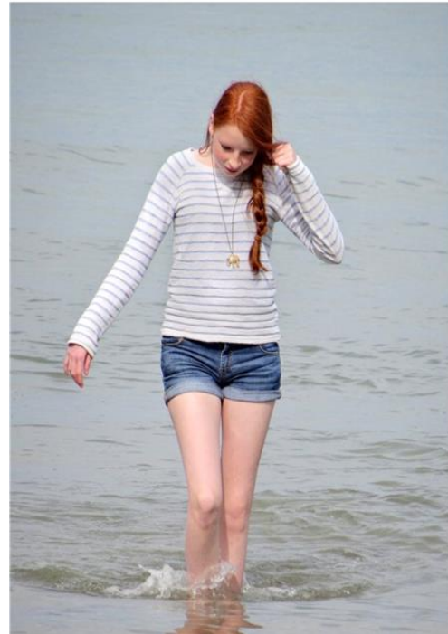
Staying in the shallows