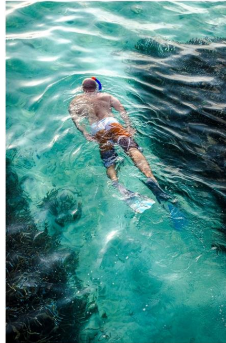
Getting your hair wet