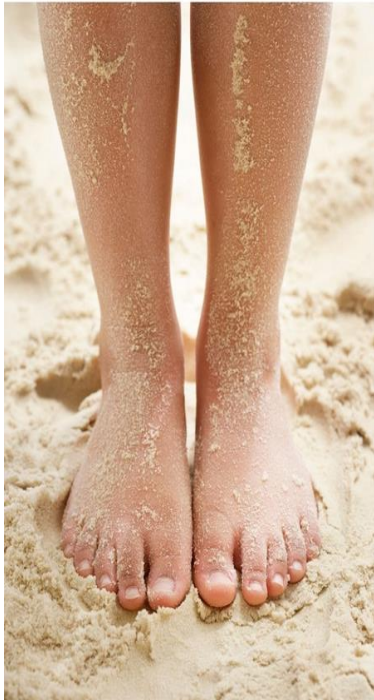
Looking at the view